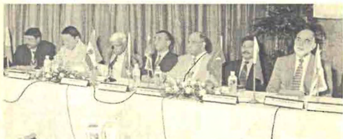
Special Session of the SACEP Governing Council- January 2003, Colombo, Sri Lanka