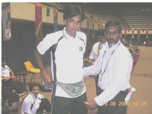
A Badminton player from Pakistan wearing a waste pouch