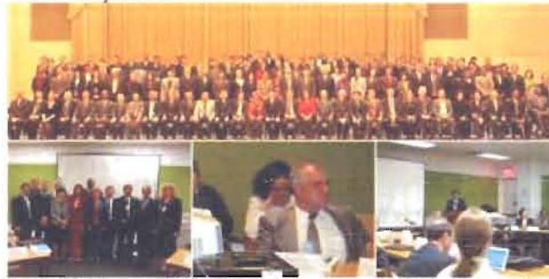
Top: CSD-19 Intersessional Conference on Building Partnerships for Moving Towards Zero Waste, 16-18 February 2011, Tokyo, Japan Bottom: Official launching of IPLA at the side event, "Building Partnership Moving Towards Zero Waste" held on 12 May 2011 during CSD-19 in New York, USA

IPLA Website: http://www.uncrd.or.jp/env/ipla/