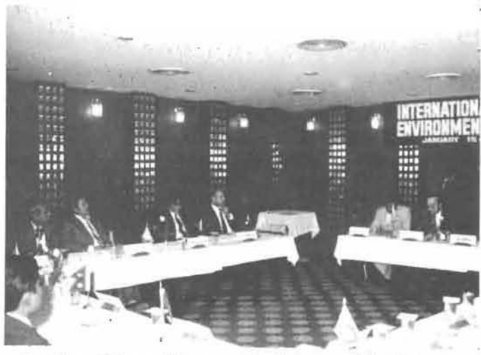
A section of the participants at the Environmental Legislation Workshop,