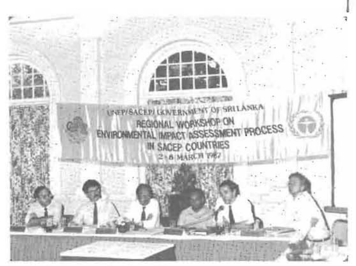
Concluding Session of E.I.A. Workshop