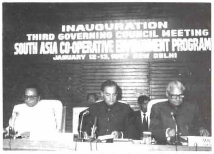
Hon, Rajiv Gandhi, Prime Minister of India at the Inauguration of the Third Governing Council Meeting of SACEP flanked by Hon Shah Moazzem Hussain, Minister of Local Government, Rural Development & Co-operatives, Bangladesh on his right and Shri Bhajan Lal, Minister of Environment and Forests, India on his left.