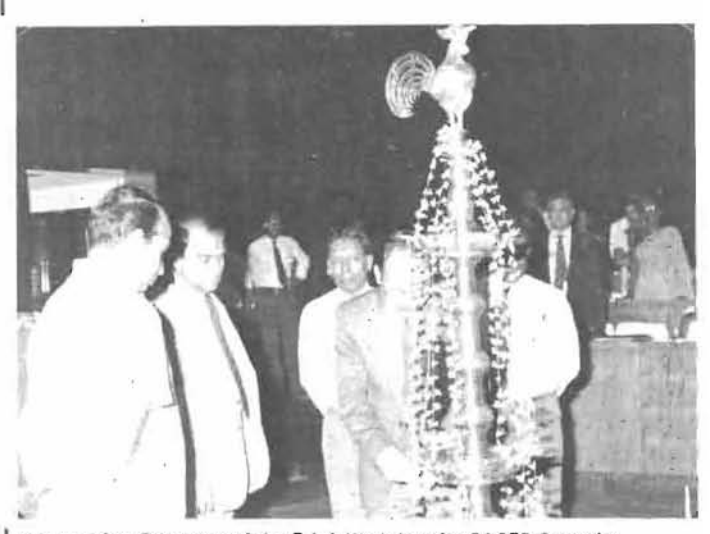
Inauguration Ceremony of the E I A Workshop for SACEP Countries.

On the final day the participants were taken on a day field trip where they observed two sites on the South West Coast of Sri Lanka, where in one there had been planned tourism whilst in the other, there had been un-planned tourism. The report of the workshop, with the recommendations for follow up activities is expected to be made available by UNEP to the participants and member governments of SACEP very shortly.