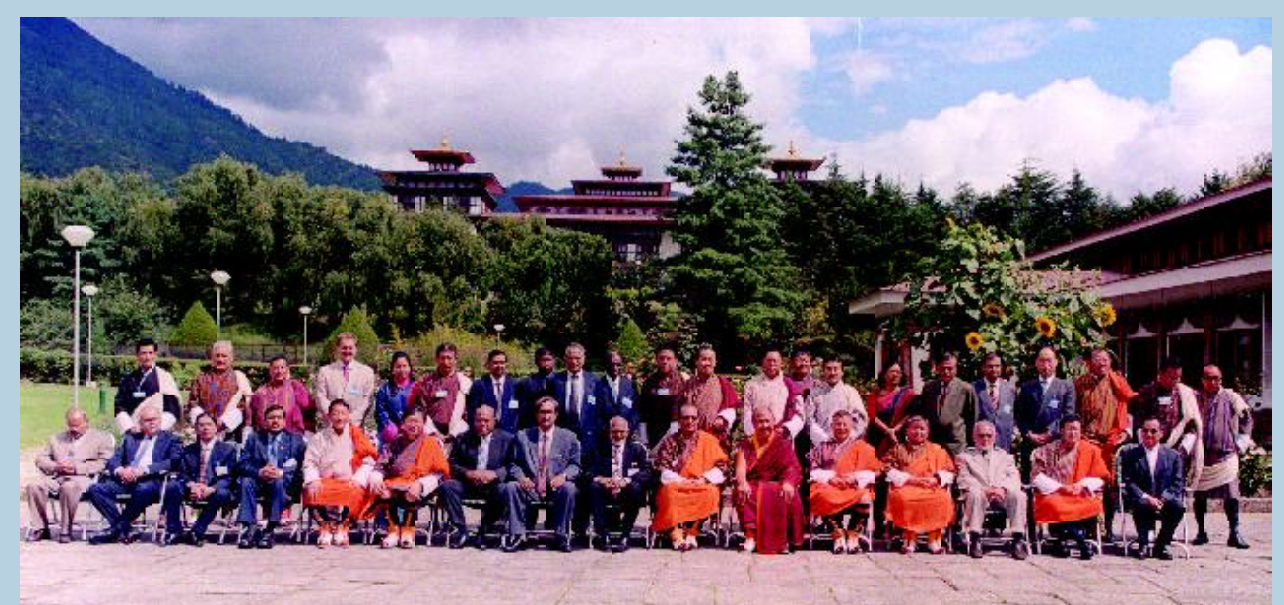
Delegates with the Hon. Prime Minister of Royal Government of Bhutan