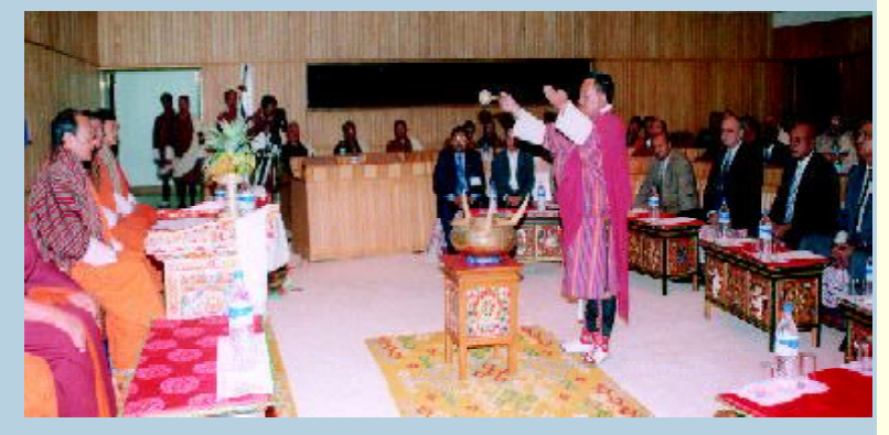
A Traditional Marchang Ceremony Conducted at the Inauguration of the GC