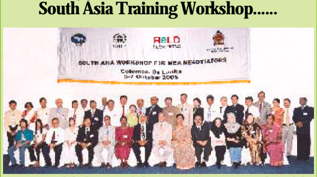
Participants with the chief guest and other invitees to the inaugaration of the Workshop

The DG also visited ADB headquarter in Manila to pursue implementation of joint environmental related activities in South Asia