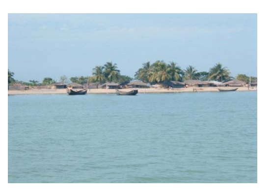
ST. MARTINS BEACH-BANGLADESH