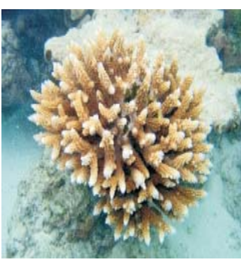
BAA ATOLL OF THE REPUBLIC OF MALDIVES

South Asia Coral Reef Task Force (SACRTF) as a Focal Point for the SA Programme of