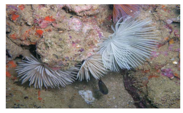
CORALS IN COSTAL AREA IN JEWANI PAKISTAN