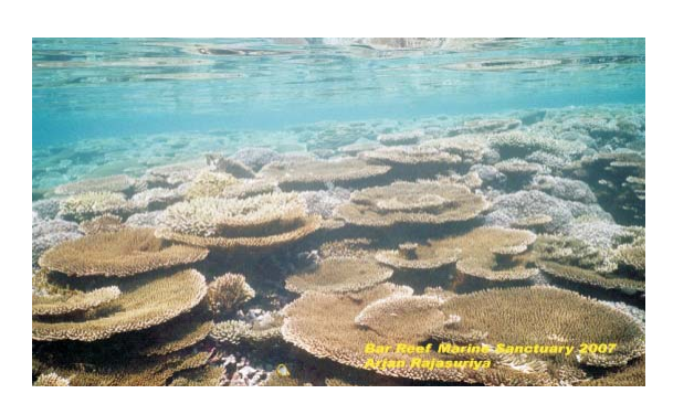
CORAL REEF PHOTO - BALL REEF PROJECT SRI LANKA

South Asia Coral Reef Task Force (SACRTF) as a Focal Point for the SA Programme of