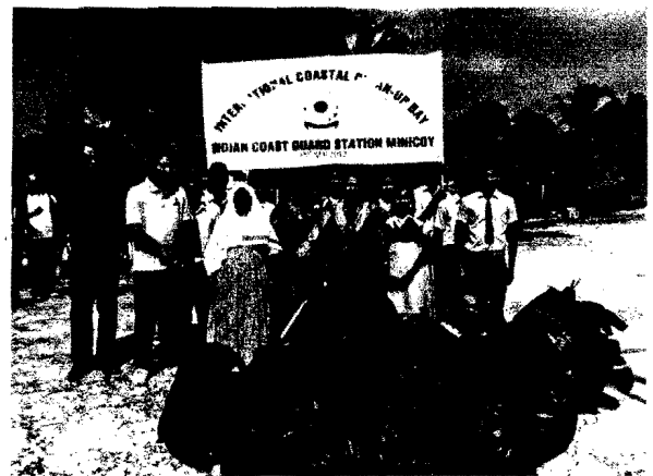
Minicoy, L&M Islands