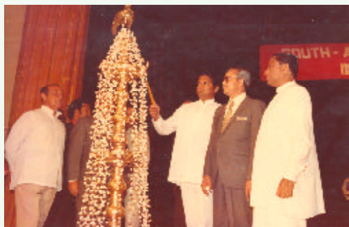
Lighting of the traditional oil lamp at the Inaugural Meeting of the South Asia Co-operative Environment Programme in February 1981.

In February 1981, the Environment Ministers of the South Asian countries met in Colombo to launch the South Asia Co-operative Environment