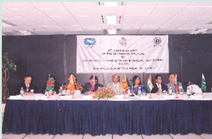
The 3rd Special Session of the Governing Council of SACEP held in November 2003. The countries agreed to move towards strengthening SACEP through the adoption of the SACEP Strategy and Work Programme.

The programme highlighted areas of work for SACEP's focus, grouped into three categories, namely: study and assessment; exchange of experience; training and capacity building. The projects covered a variety of areas, including sustainable development, environmental law, forestry, land, coastal and marine issues, wetlands, coral reefs, inland water resources, biodiversity and environmental economics. SACEP's focus is on the implementation of this work programme, formulated according to the needs of the region.