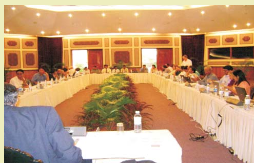
Ninth Session of the Intergovernmental Meeting and the Fourth Session of the Regional Stakeholders cum Coordination Meeting at Male , Maldives