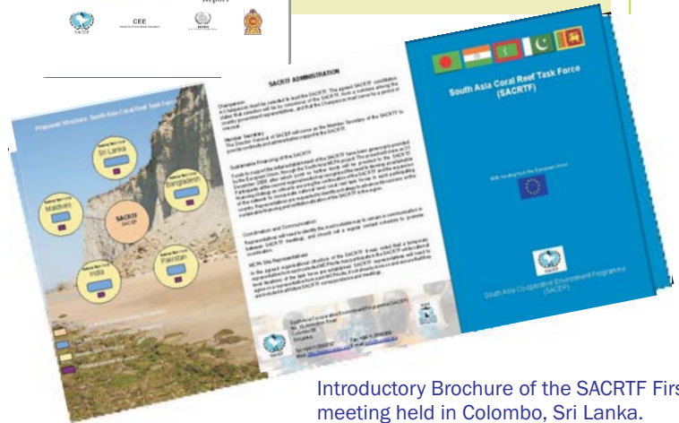
Introductory Brochure of the SACRTF First meeting held in Colombo, Sri Lanka.

Report of the “ Sobasankalpana’ School Environmental awareness Programme 2007 and Pannel Discussion on “Adaptation to Sea Level Rise in South Asia” 16th July 2007