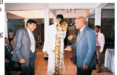
Meeting Inauguration, by the lighting of oil-lamp

The Hon' Ministers released two documents at the meeting viz the Report of the Second Workshop of the MCPA Project and a Brochure on the SACRTF.