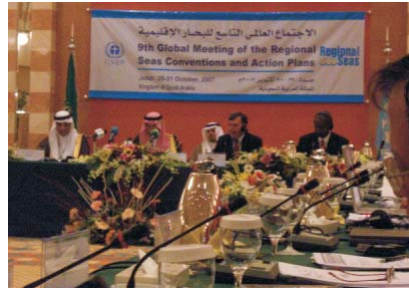
Inauguration of the Meeting

working together to protect the Global Seas through 18 regional seas programmes out of which SACEP houses the South Asian Seas Programme. There were 70 participants representing 36 programs and organization. 25 of them represented Regional Seas Programs and 21 participants represented 17 organizations and authorities. In addition to 24 participated as observers, most of them from PERSGA Region.