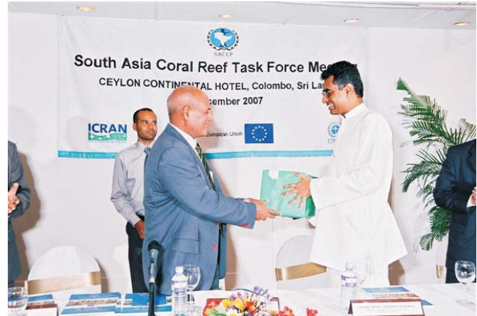
Hon. Minister for Energy, Environment and Water, Mr. Ahmed Abdullah, Republic of Maldives delivering some publications to Mr. Patali Champika Ranawaka, Hon. Minister of Environment and Natural Recourses, Sri Lanka.