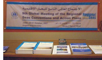
SACEP Publications of SACRTF and EC Project Reports on display at the Meeting