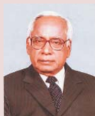
Message by His Excellency Prof. Iajuddin Ahmed, President of the People's Republic of Bangladesh

"SACEP is a common platform for South Asian Countries to work together for a better South Asia in terms of protection of environment and sustainable use of natural resources and biological diversity which the region is blessed with. A large population and low level of economic attainment have restricted South Asia from doing justice to the management of the natural resources till today ..... I consider, economic development should not be at the cost of environmental degradation... .....I hope all the government of this region will come forward with every possible support to SACEP for making it an effective regional environmental organization. To that end, I reiterate the support of our people and the government towards SACEP."