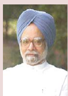
Message by His Excellency Dr. Manmohan Singh, Prime Minister of the Republic of India

"With its mission to promote regional cooperation in the field of environmental management and sustainable development, SACEP today is lauded as the oldest regional intergovernmental environmental organization in the world. The organization is a reflection of our region's collective commitment to sustainable development and recognition that cooperative action is crucial to address both environmental degradation and poverty alleviation in the region.....Bhutan remains committed to the ideals and visions of SACEP and I extend my best wishes and Tashi Delek for the success of the organization in promoting environmental conservation and sustainable development in our region."