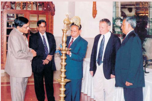
Inauguration of the Ceremony by the lighting of oil-lamp

A Regional Workshop on Development of a Regional UNEP and SACEP/SAS Activity on Marine Litter for the South Asian Seas was held in Colombo, Sri Lanka on 20 – 21 August, 2007.