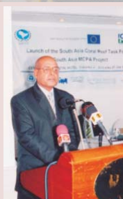
H.E. Mr. Ahmad Abdulla, Chairman SAS and Minister of Environment Water and Energy, Maldives speaking on the occasion.

The Chief Guest, H.E., Mr. Ahmed Abdullah, Minister for Environment, Energy and Water, Republic of Maldives, spoke on the depletion of the Ozone Layer and the mounting evidence of the impending disaster of rising sea level. He congratulated SACEP on their efforts for the betterment of the environment in the region, highlighting the significant role the SACRTF could play in helping to mitigate the major environmental issues pertaining to marine resource conservation.