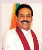
Message by His Excellency Mr. Mahinda Rajapakse, President of Democratic Socialist Republic of Sri Lanka

"The SACEP represents our commitment to make collective efforts to address the environmental problems we are facing and to attain the lofty goal of sustainable development in the region. The efforts made by the SACEP in the field of Environmental Management are noteworthy .However , much remains to be done. I am confident that the SACEP will continue to make sustained efforts to address, in a comprehensive manner, environment related challenges and problems including those associated with climate change..... I wish the SACEP all success in its Endeavours ! "