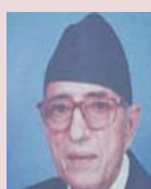
Message by His Excellency Mr. Girija Prasad Koirala, Prime Minister of Royal Government of Nepal

"Since its inception in 1982, SACEP has made an important contribution to promoting cooperation in protecting and preserving the environment of its member -states.....SACEP has successfully implemented a number of Programmes and projects in a variety of areas, including air pollution, protection and management of the coastal environment and environmental legislation.....SACEP's role in strengthening environmental protection standards in the Maldives is indeed significant. In this regard, I recall SACEP's assistance towards improving our State of the Environment reporting, and the implementation of the first phase of the historic 'Male' Declaration on Control and Prevention of Air Pollution and its Transboundary Effects for South Asia'.....I am confident that SACEP will go from strength to strength, and continue to work in partnership with the member countries in preserving and protecting our environment."