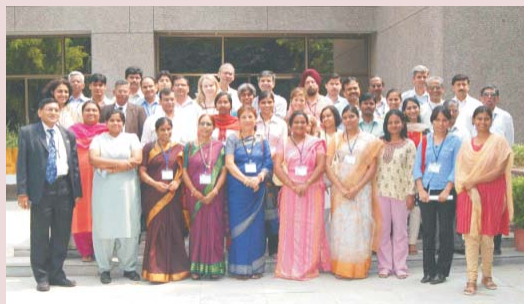
Participants at the Workshop

A need for a Regional Task Force for the management of e - waste in the region was discussed and steps to be taken in future for its establishment were recommended.