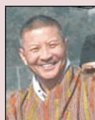
Message by His Excellency Mr. Lyonpo Khandu Wangchuk , Prime Minister of the Kingdom of Bhutan

"SACEP is a common platform for South Asian Countries to work together for a better South Asia in terms of protection of environment and sustainable use of natural resources and biological diversity which the region is blessed with. A large population and low level of economic attainment have restricted South Asia from doing justice to the management of the natural resources till today ..... I consider, economic development should not be at the cost of environmental degradation... .....I hope all the government of this region will come forward with every possible support to SACEP for making it an effective regional environmental organization. To that end, I reiterate the support of our people and the government towards SACEP."