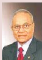
Message by His Excellency Mr. Maumoon Abdul Gayoom, President of the Republic of Maldives

"At the United Nations conference on the Human Environment in Stockholm in 1972, the Prime Minister , Mrs.Indira Gandhi expressed the feelings of many developing countries when she said ' How can we speak to those who live in villages and in slums about keeping the oceans, the rivers and the air clean when their own lives are contaminated at the source? The environment cannot be improved in conditions of poverty'. India is committed to a process of sustainable development that maintain a balance and harmony between the environment and imperative economic growth. I extend best wishes to SACEP on this significant milestone."