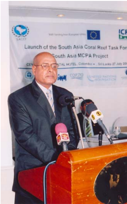
Hon. Minister for Energy, Environment and Water, Mr. Ahmed Abdullah, Republic of Maldives delivering his speech during the launch of the SACRTF.