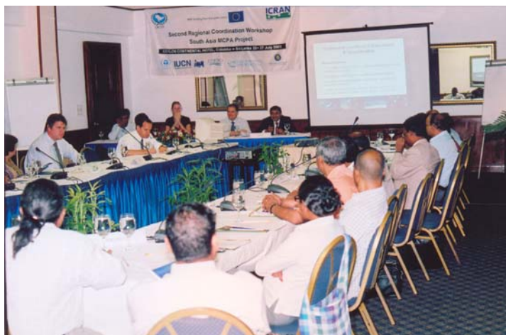
The second regional coordination workshop of the South Asia MCPA project being held at the Garnet Hall, Hotel Ceylon Continental, Colombo, Sri Lanka.