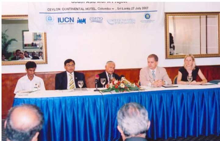
Press briefing event