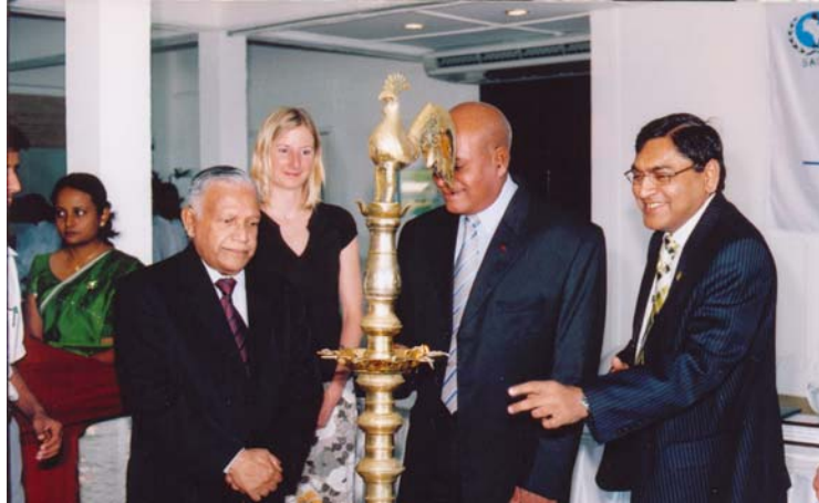
Inauguration of the SACRTF launch ceremony by the lighting of oil-lamp